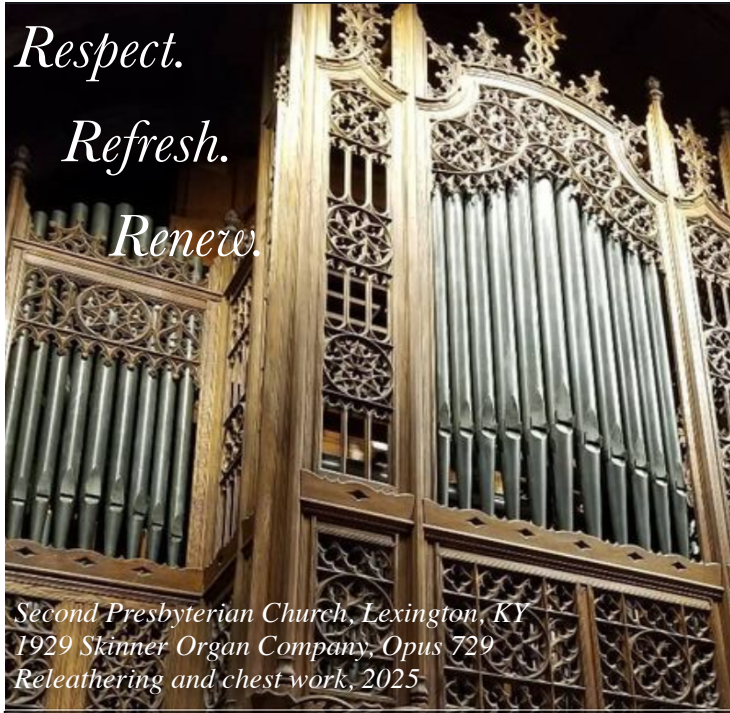
Second Presbyterian Church, Lexington, KY 1929 Skinner Organ Company, Opus 729 Releathering and chest work, 2025