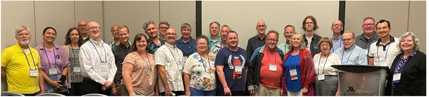
Great Lakes Region Business Meeting at the Convention