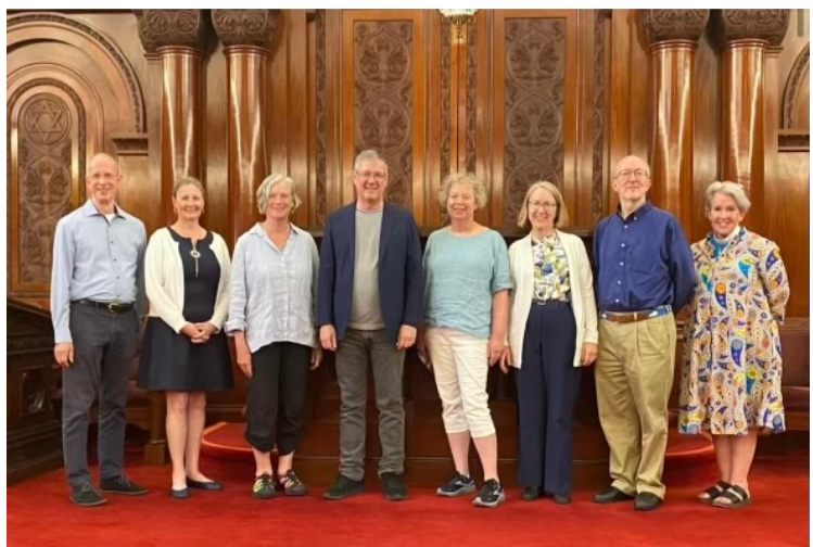
Congratulations to the 2024-2026 Regional Ambassadors